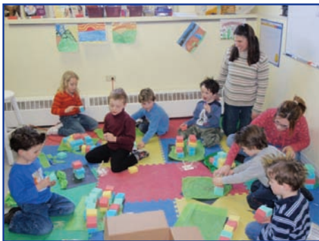
Building Mayan temples

To learn more about Touchstone, or to arrange for a tour, please contact us. We'd love to hear from you!