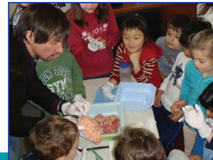
Exploring the brain