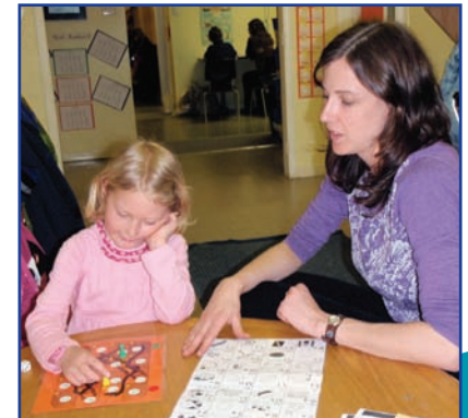
One-on-one counting fun