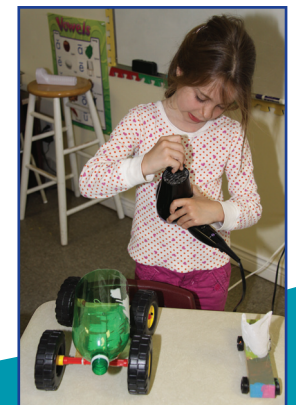
"Invention Convention" Discovering simple machines