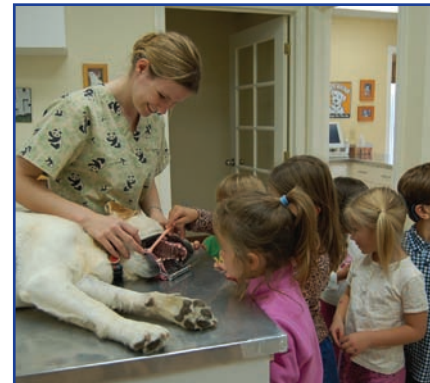
Visiting a veterinarian

Visit us at www.touchstonecommunityschool.ca