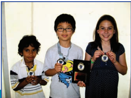
Medal winners, national math competition

2 Striving for academic excellence Our students and graduates have competed and placed highly in several competitions, including the Canwest Canspell Regional Spelling Bee, the Great Canadian Geography Contest, and Canadian math competitions. We're also proud to note that our students consistently receive high scores in the provincial reading comprehension and math assessments.